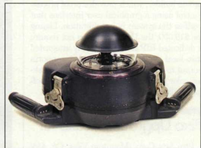
AVCAM 350 degree pan camera